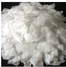
Caustic Soda Flakes/Lye