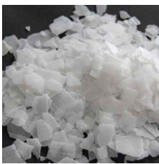
Caustic Potash Flakes