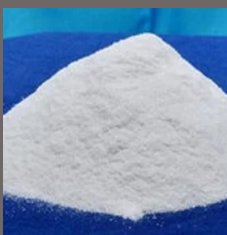
Quartz Lumps / Powder

Connect with us. We are ready to meet your sourcing needs, and expectations.