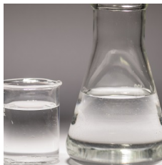
Methylene Chloride (MDC)